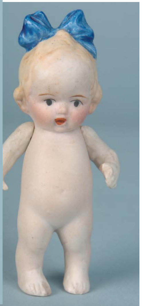
Antique Dora has a pale pink overall wash, blond hair and bright blue bow. The eyes are simply black dots and only the upper eye rim is outlined. The light brown eyebrows are the one-stroke type.