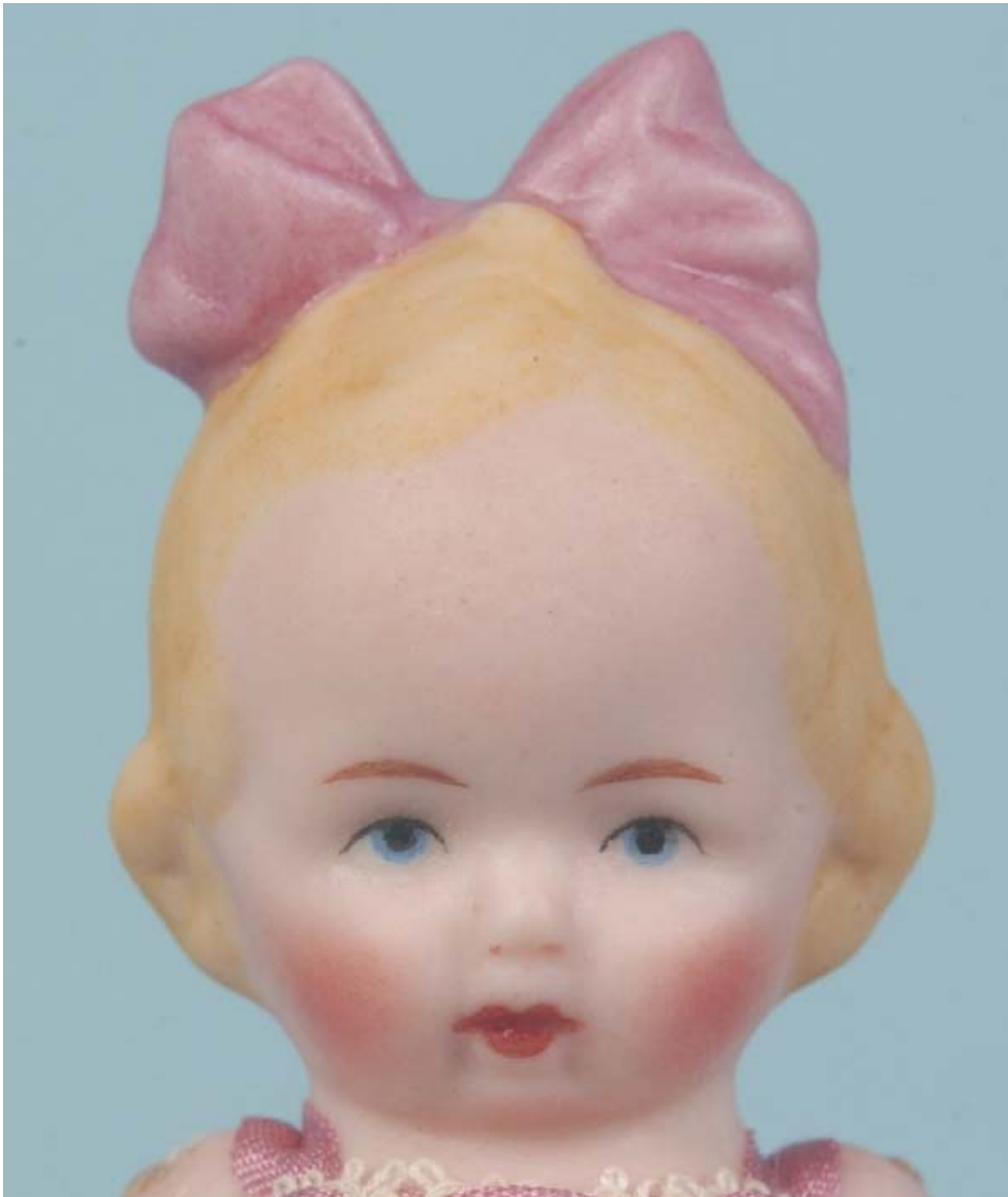
Kitty painted this version of Dora with a pink hair bow and blue eyes.

All china paint firings are to witness cone 018.